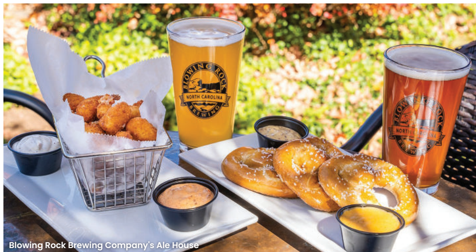
Blowing Rock Brewing Company's Ale House

EVENING → You know a restaurant's a neighborhood favorite when its walls are covered with photos of residents. But at Bistro Roca , the featured locals have fur and four feet. The cocktail list is worth barking about too, with wry craft concoctions such as the Third Husband (tequila, chili lime mixer, and Campari) and the Barry White Sangria (prosecco, St-Germain, and vermouth-soaked local berries). For dinner, the chimichurri-marinated lamb is a winner, as are the artisan pizzas. Ward off a night chill with the bourbon pecan bar, a delightfully gooey treat served warm with vanilla ice cream and orange-maple glaze.