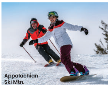
Appalachian Ski Mtn.

The Blue Ridge Mountains may be a billion years old, but it wasn't until the early 1960s that folks decided this region would be a good place to ski. That's when