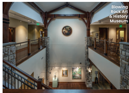
Blowing Rock Art & History Museum

heritage. Catch the introductory film and rotating exhibits, then bundle up for the history walk. A short stroll reading bronze plaques "spills the tea" on former residents, including the first mayor, who got drunk one night and stamped a herd of cattle through town. The next morning, he opened court and fined himself $1 for disorderly conduct. Today the town celebrates him.