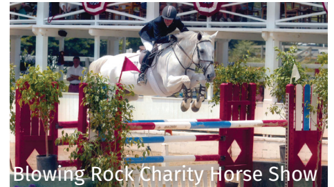
Blowing Rock Charity Horse Show