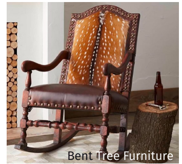
Bent Tree Furniture

5589 US 321 S | 828-295-4585 themustardseedmarketnc.com