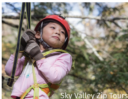
Sky Valley Zip Tours

Among BEST SOUTHERN DESTINATIONS FOR FAMILY REUNIONS by Southern Living Magazine in 2025