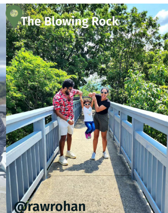
The Blowing Rock