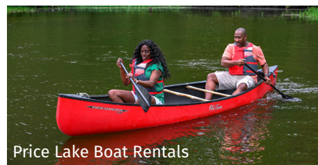
Price Lake Boat Rentals

7593-B Valley Blvd, Blowing Rock | 828-414-9800 rhoddiebicycleoutfitters.com | Full service bicycle shop with sales, repairs, and fitting services. Ride maps and route planning, too!