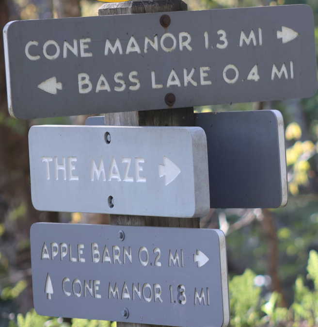
Cone Carriage Trails

Voted A TOP TINY TOWN FOR ADVENTURE by readers of Blue Ridge Outdoors Magazine in 2024