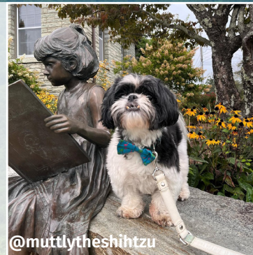
The Blowing Rock