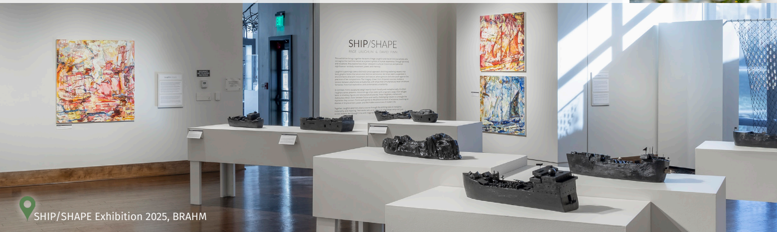
SHIP/SHAPE Exhibition 2025, BRAHM