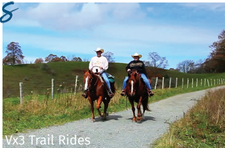
Vx3 Trail Rides