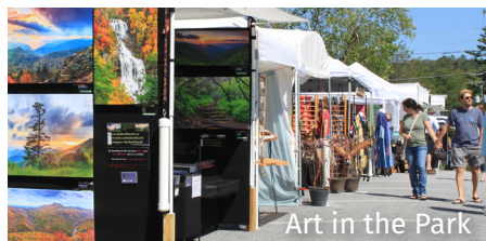
Art in the Park

Year round at Chetola, Speckled Trout, Town Tavern, and Twigs.