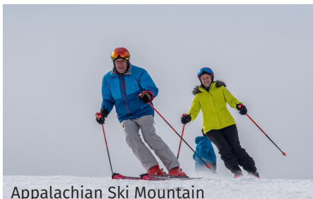
Appalachian Ski Mountain

Banner Elk | 828-898-4521 | skisugar.com Ski, snowboard, tube, ice skate, and snow shoe day and night! 20 trails, 7 lifts, ski & snowboarding school. Summer lift rides, mountain bike park, and special events!