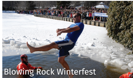
Blowing Rock Winterfest